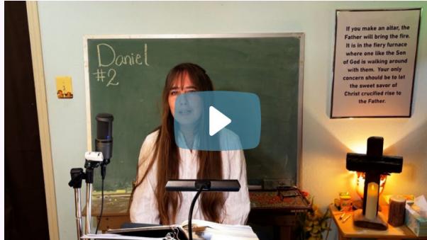
Daniel #2 - The King's Portion

Below are two recent classes from our current sharing out of Daniel!