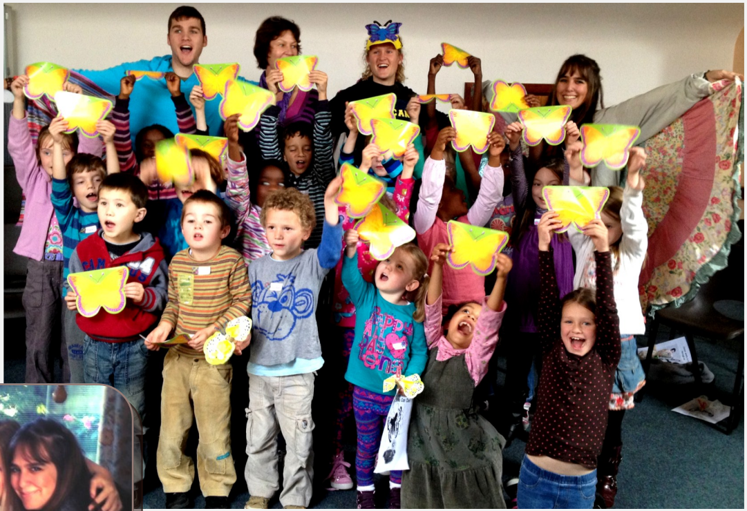
You Can Be a Butterfly Bible-Club