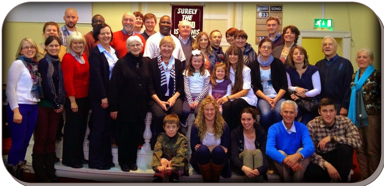
“Walking in The Spirit” Conference