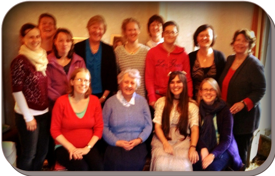
Women's Bible Study and Tea Party