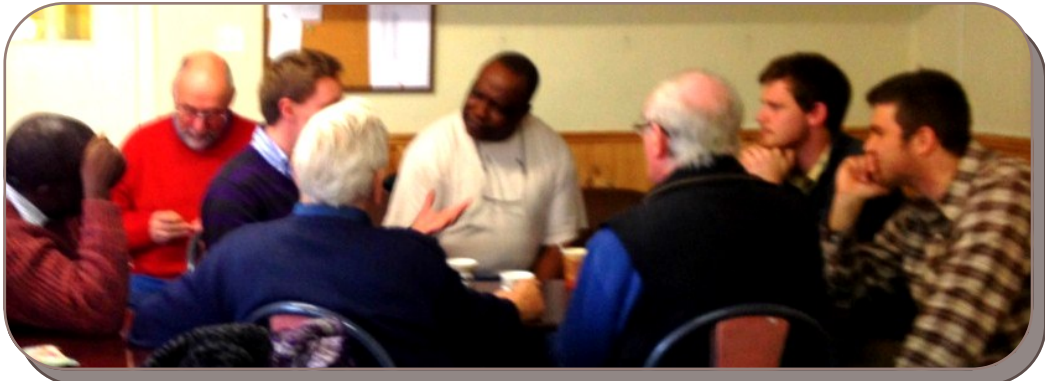
Men's Discussion Group at Conference