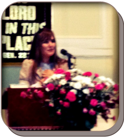
Ministering at Methodist Church