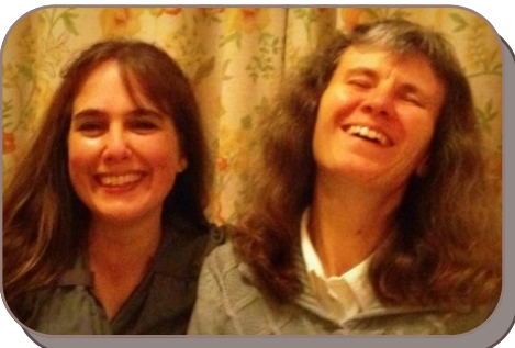
Time with friends In Holland