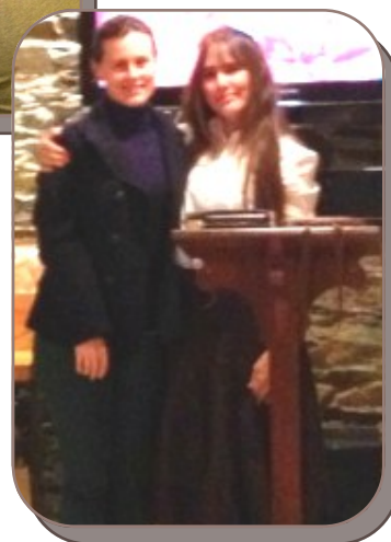
Our First “All Irish” Ministry Team!