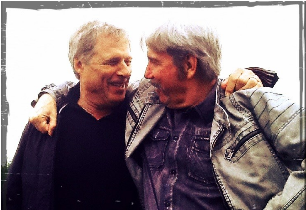
Together Preaching Christ Crucified