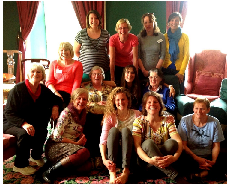
The Women's Conference