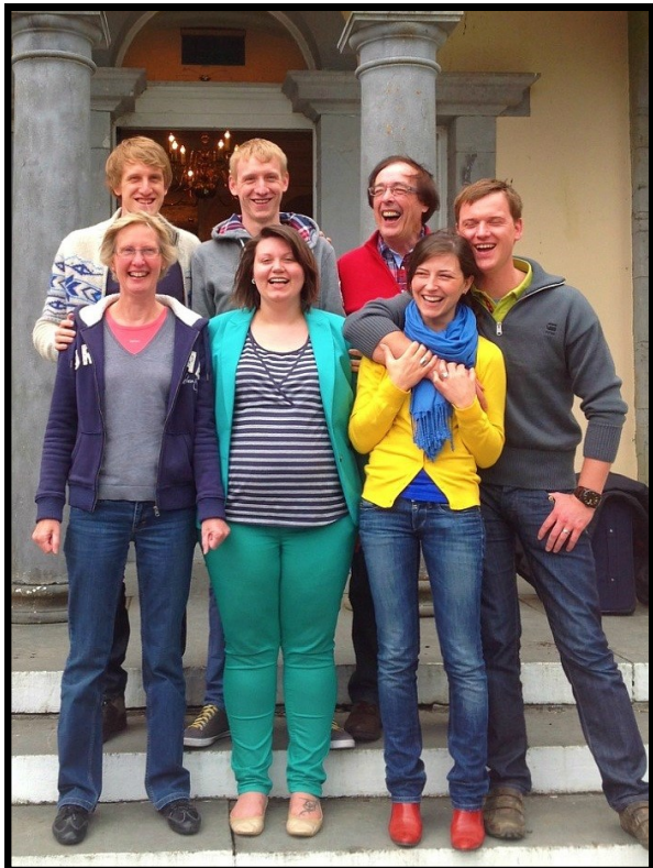
Hungry Hearts From Belgium!