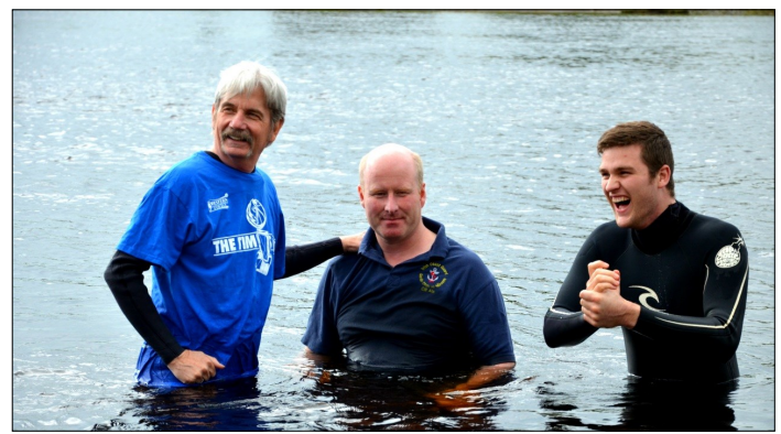
Baptizing in the River Shannon