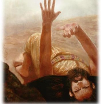
How Saul Became Small (Paul)

This month the Lord gave inspiration to put the newsletter article into a video presentation. In my heart I feel as if this video was given from the Lord as a meditation to help further soften and open our hearts to the precious work God is doing in us to bring forth His Son. Please consider setting aside 10 minutes to be before the Lord and let Him minister to your heart through this video. This video can be viewed on the Fire Ministries website homepage and also on YouTube at: https://youtu.be/d8LJQvY6_9Y