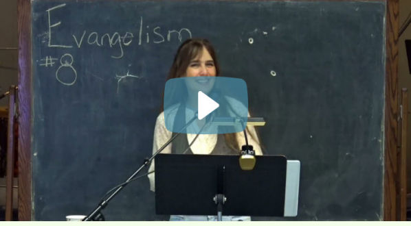
Evangelism Class #8 Preparing Our Hearts and Preparing the Way