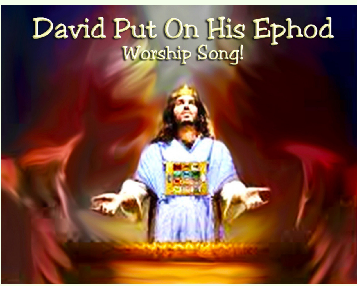
"David Put On His Ephod" Song

(Please click on the image below to listen and download!)