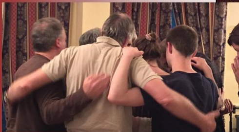
Ireland Conference - 2015